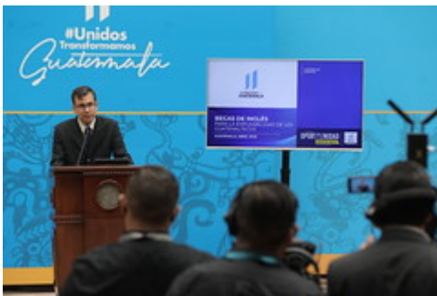
Conferencia de Prensa Semanal 20222504 by Gobierno de Guatemala uploaded on 25 Apr 2022