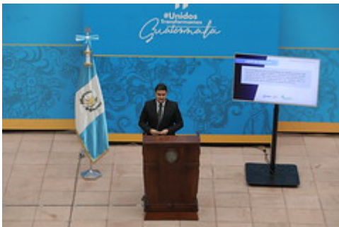
Conferencia de Prensa Semanal 20222504 by Gobierno de Guatemala uploaded on 25 Apr 2022