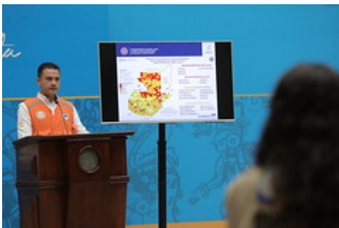
Conferencia de Prensa Semanal 20222504 by Gobierno de Guatemala uploaded on 25 Apr 2022