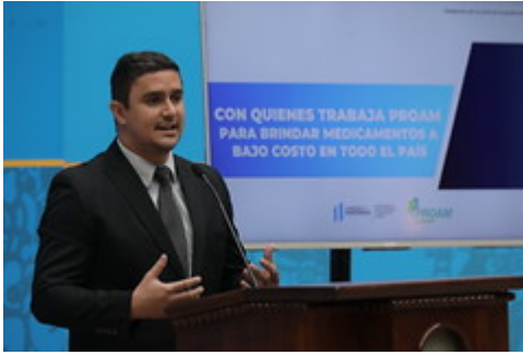
Conferencia de Prensa Semanal 20222504 by Gobierno de Guatemala uploaded on 25 Apr 2022