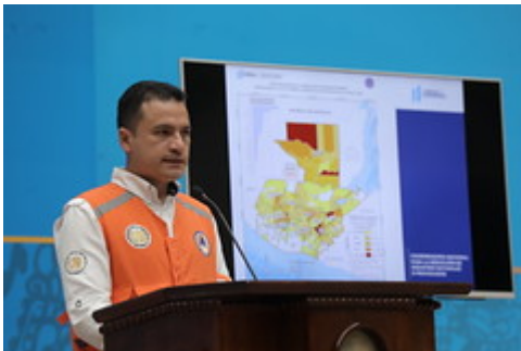
Conferencia de Prensa Semanal 20222504 by Gobierno de Guatemala uploaded on 25 Apr 2022