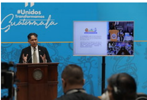
Conferencia de Prensa Semanal 20222504 by Gobierno de Guatemala uploaded on 25 Apr 2022