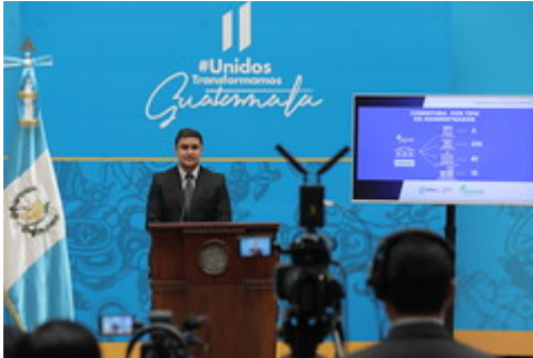
Conferencia de Prensa Semanal 20222504 by Gobierno de Guatemala uploaded on 25 Apr 2022