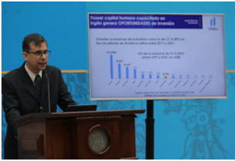
Conferencia de Prensa Semanal 20222504 by Gobierno de Guatemala uploaded on 25 Apr 2022