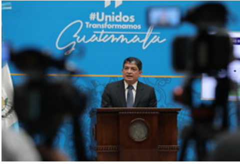
Conferencia de Prensa Semanal 20222504 by Gobierno de Guatemala uploaded on 25 Apr 2022