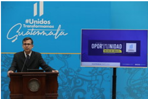
Conferencia de Prensa Semanal 20222504 by Gobierno de Guatemala uploaded on 25 Apr 2022