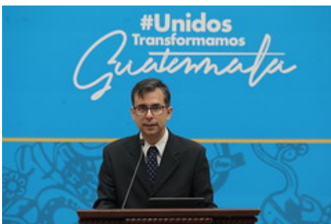
Conferencia de Prensa Semanal 20222504 by Gobierno de Guatemala uploaded on 25 Apr 2022