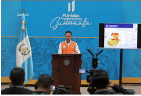
Conferencia de Prensa Semanal 20222504 by Gobierno de Guatemala uploaded on 25 Apr 2022