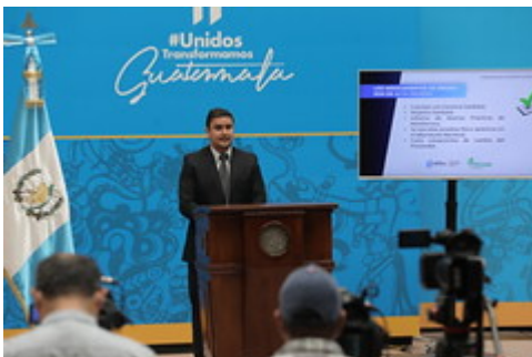
Conferencia de Prensa Semanal 20222504 by Gobierno de Guatemala uploaded on 25 Apr 2022