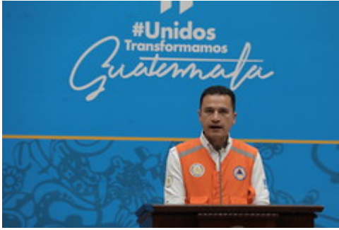
Conferencia de Prensa Semanal 20222504 by Gobierno de Guatemala uploaded on 25 Apr 2022