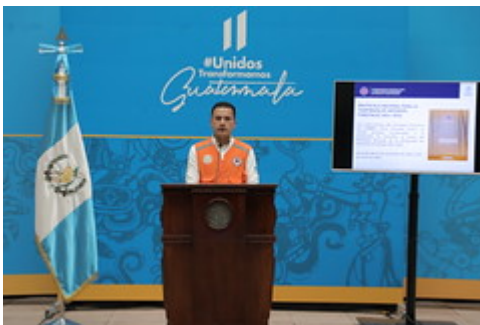
Conferencia de Prensa Semanal 20222504 by Gobierno de Guatemala uploaded on 25 Apr 2022