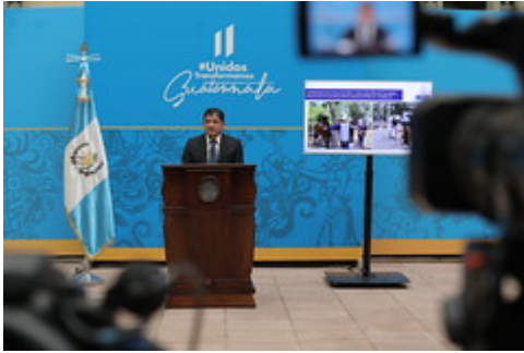
Conferencia de Prensa Semanal 20222504 by Gobierno de Guatemala uploaded on 25 Apr 2022