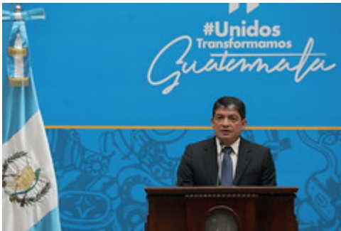
Conferencia de Prensa Semanal 20222504 by Gobierno de Guatemala uploaded on 25 Apr 2022