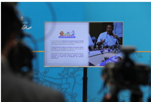
Conferencia de Prensa Semanal 20222504 by Gobierno de Guatemala uploaded on 25 Apr 2022