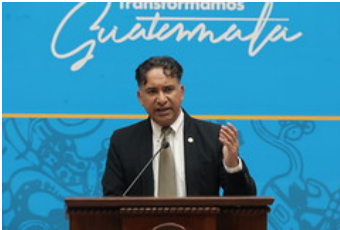
Conferencia de Prensa Semanal 20222504 by Gobierno de Guatemala uploaded on 25 Apr 2022