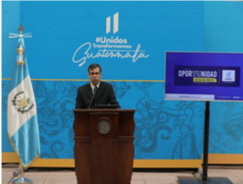
Conferencia de Prensa Semanal 20222504 by Gobierno de Guatemala uploaded on 25 Apr 2022